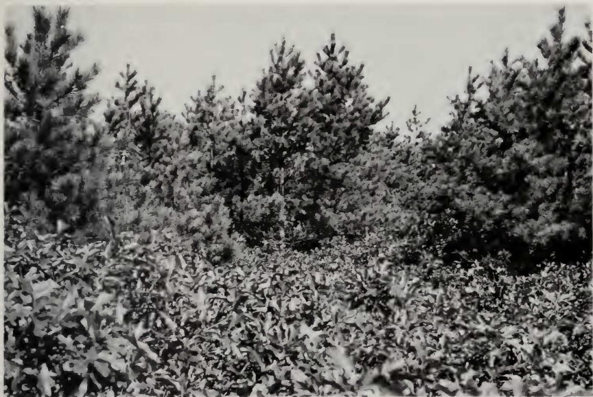
FIG. 1. The REGN study plot at the time of the study (13 years after the fire). Note that both oak and pine layers have regenerated (compare Fig. 2).

REGN was also monospecific and contained only Q. ilicifolia ( N = 470 ) with a mean height of 1.10 m, a density of 9400 clumps/ha and 53.0% cover. In addition, the BURN's shrub layer was slightly more diverse (85% Q. ilicifolia , 15% six other species; N = 541 ). This layer had a mean height of 0.72 m, a density of 10820 clumps/ha and 40.6% cover. Herb layers in both plots were essentially identical. Fewer than 6 species accounted for over 90% of the total herb cover (principally G. baccata , V. vacillans , V. angustifolium and spring wintergreen, Galtheria procumbens ) and only 19 herb species were found in the sample squares.